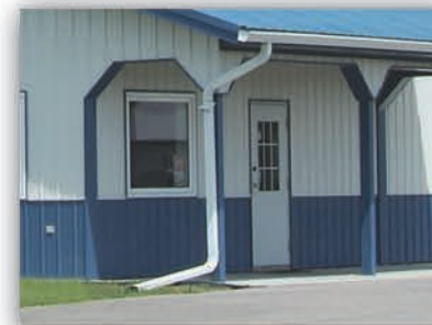
Optional: Gutter and downspout helps move water away from the building