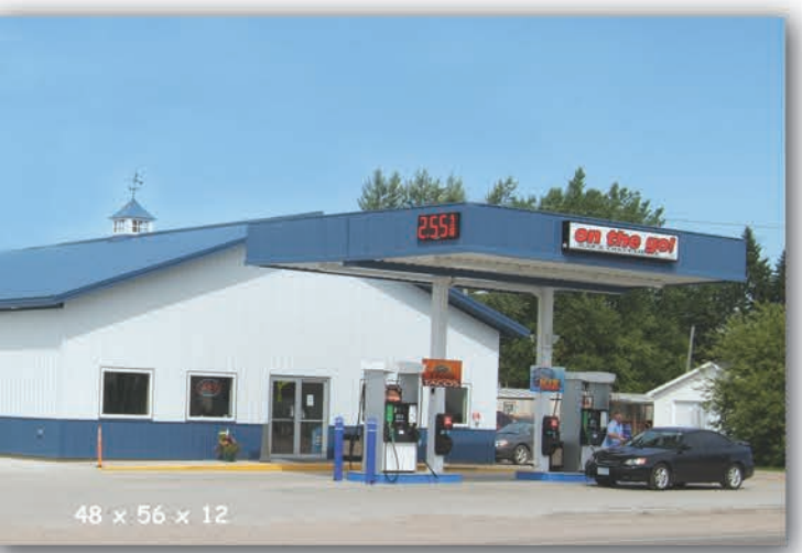
48 x 56 x 12

How do we help? It starts with our representatives. With more than 30 years of post frame construction experience, and knowing what challenges come with each project, we'll help provide peace of mind. We know the components and materials you'll need, and help with the tough decisions that come with building. We'll coordinate with other contractors on special requirements for your project for a more realistic timetable on each phase of construction. Our skilled construction crews are professionals and can build year 'round. We are courteous and will leave a finished building site ready for you to move into and use right away.