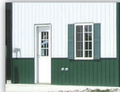
Maintenance free insulated doors and windows are available in a wide variety of styles.