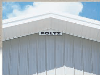
Elite Series Steel Panels using G100 galvanized. Available in a variety of colors and trim packages.