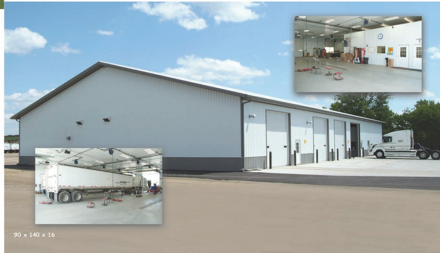
90 x 140 x 16