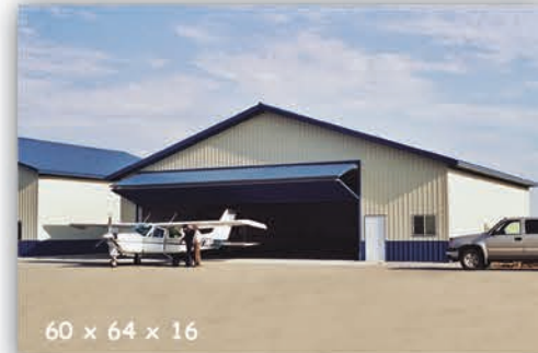
60 x 64 x 16