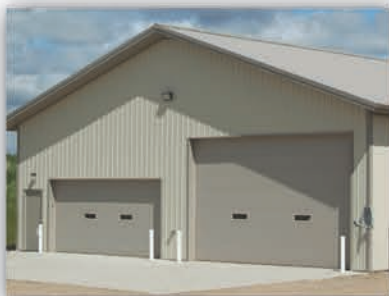
Durable overhead doors are matched with a tough and powerful lift system.