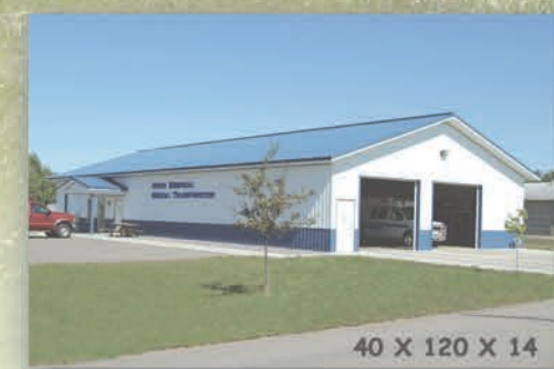
40 X 120 X 14