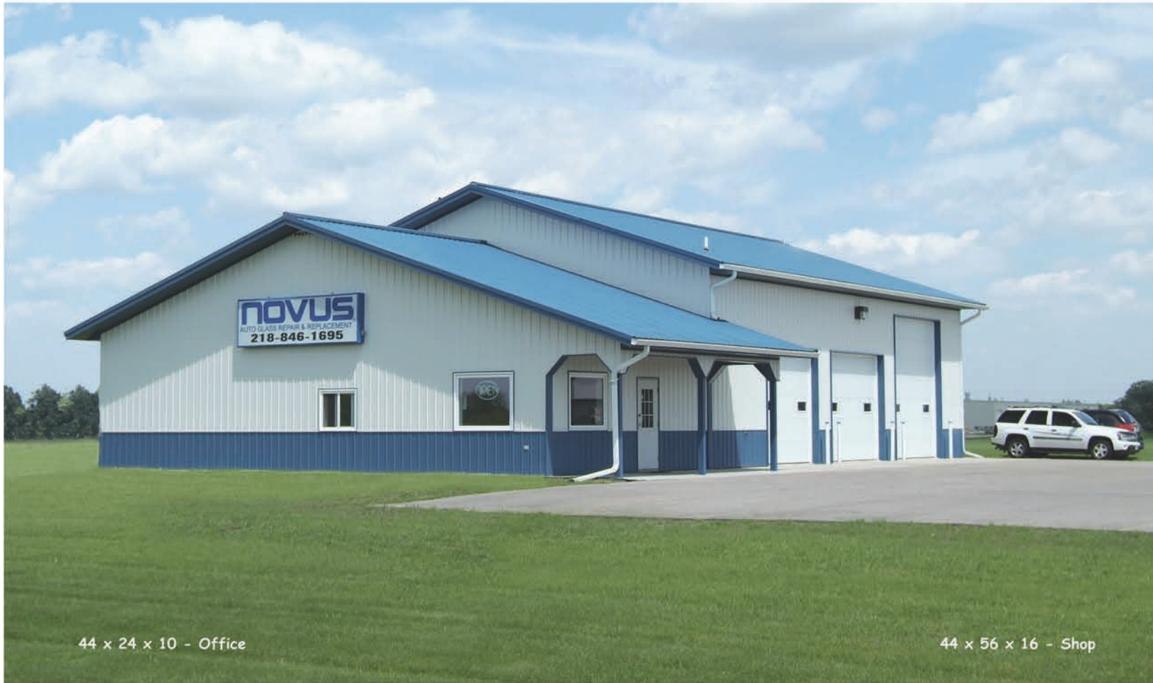
44 x 24 x 10 - Office