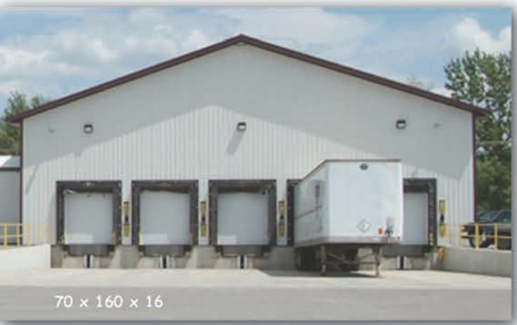
70 x 160 x 16