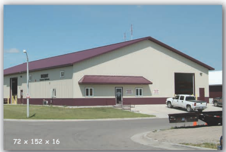
72 x 152 x 16