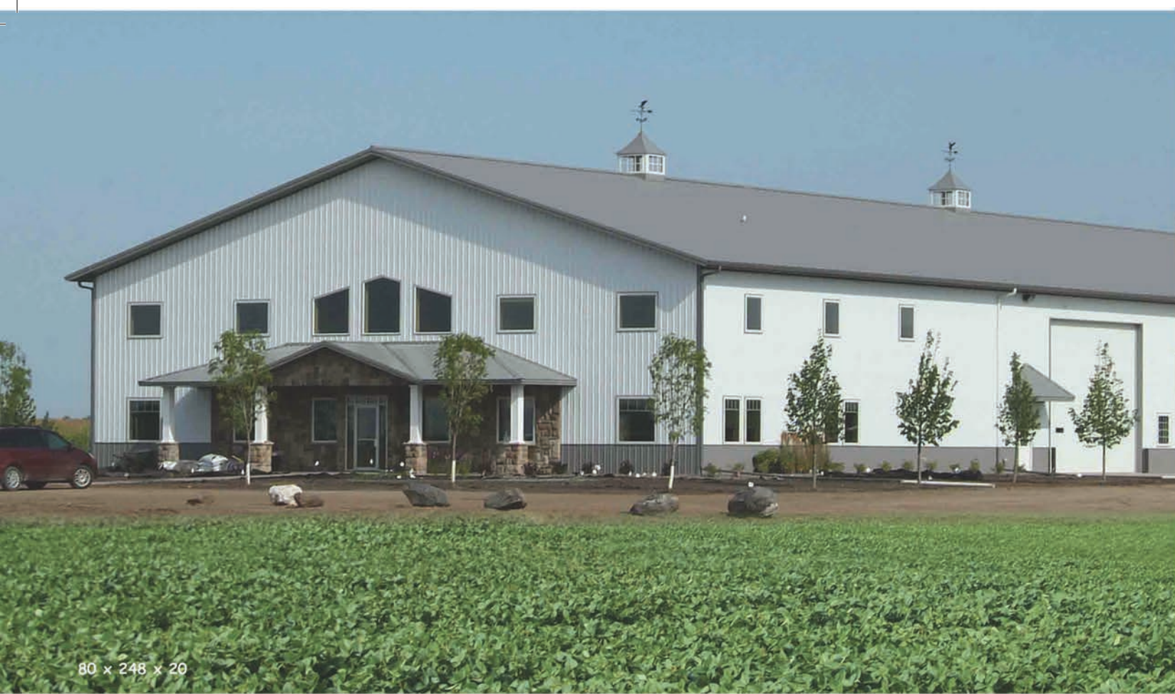
80 x 248 x 20