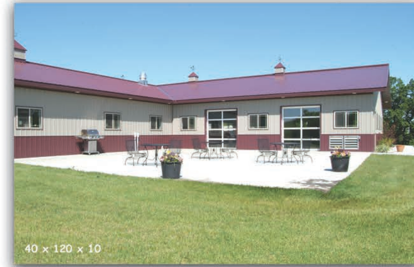
40 x 120 x 10