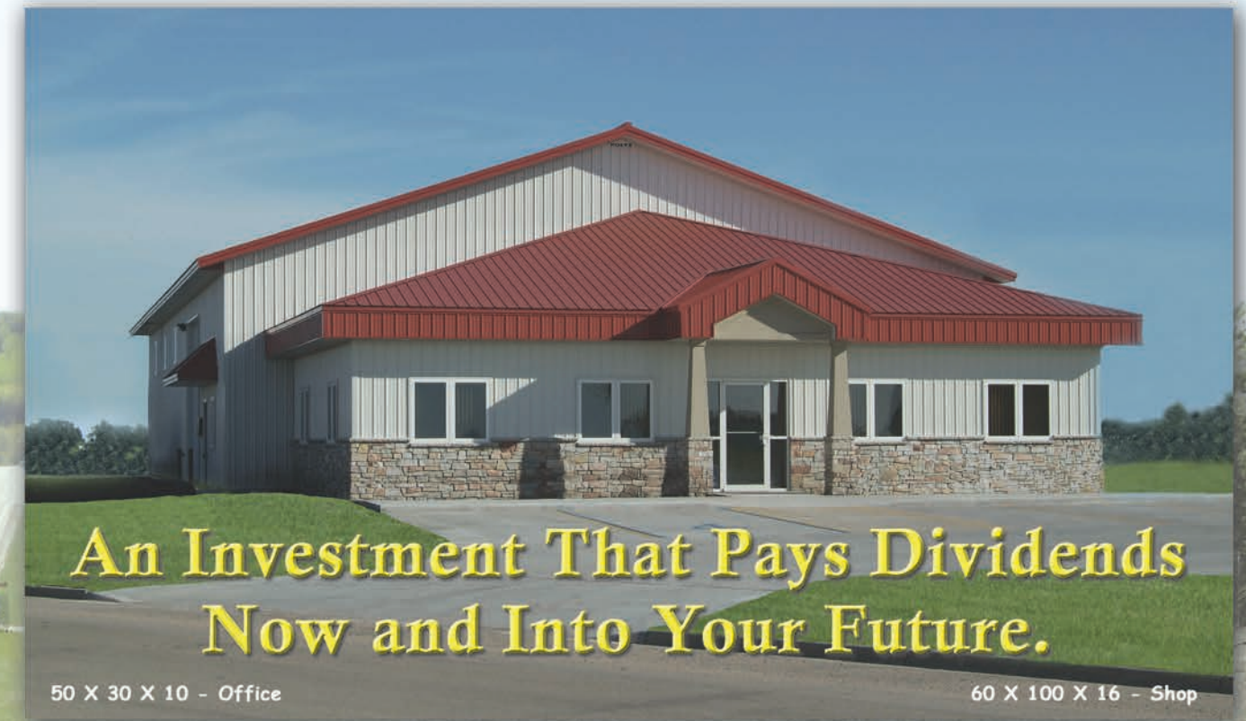
50 X 30 X 10 - Office

Ask any of our customers, when you need it built right and built to last, no one does it better than Foltz.