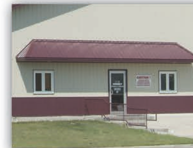
Add a marquee awning, dormers or covered vestibule to make your building stand out.