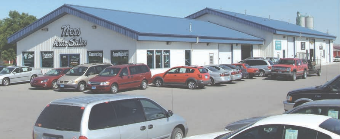
60 x 120 x 16 - Shop