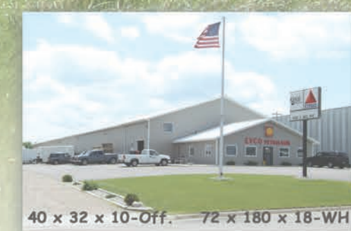
40 x 32 x 10-Off. 72 x 180 x 18-WH