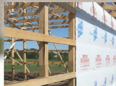
Optional: Building wrap on the outside walls minimizes moisture and humidity penetration.