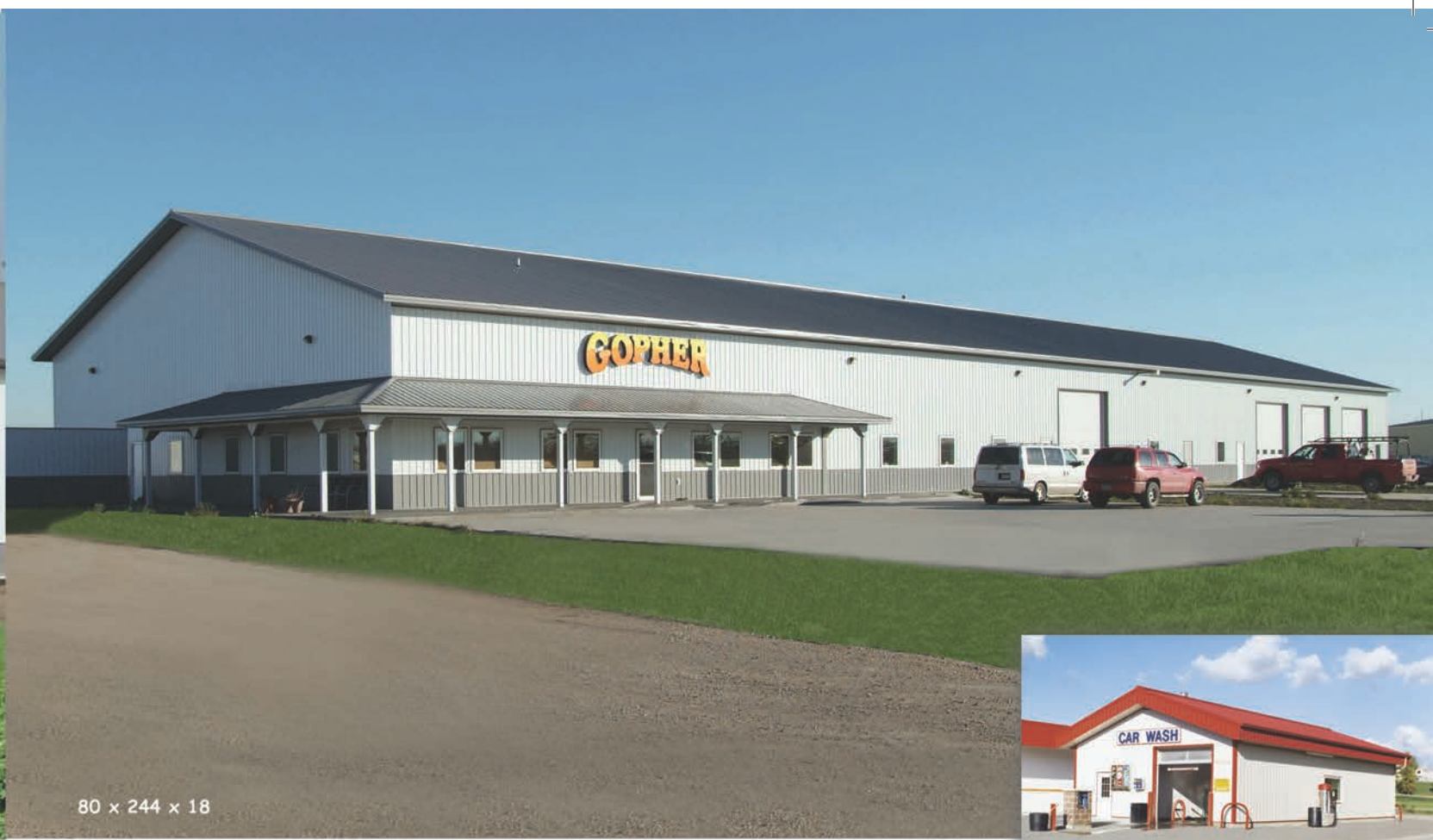
80 x 244 x 18