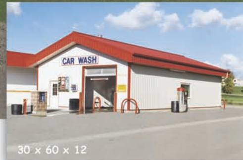
30 x 60 x 12