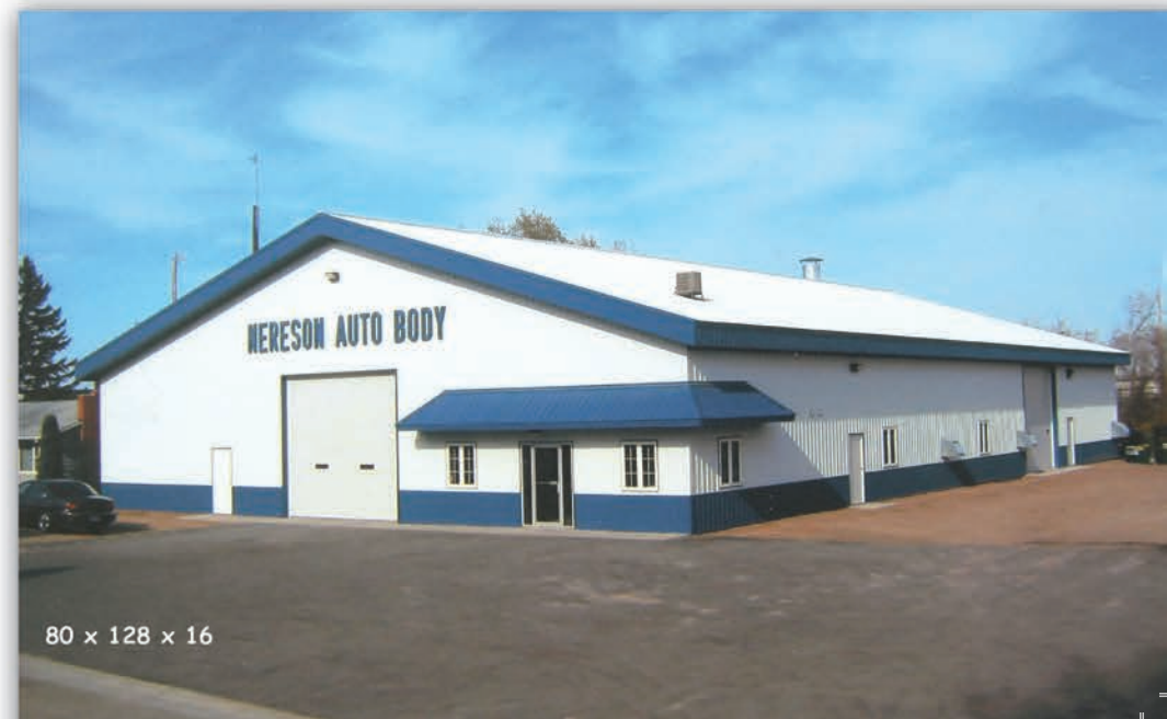
80 x 128 x 16