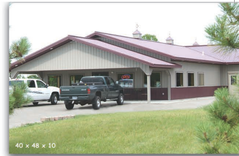
40 x 48 x 10