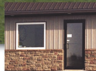
Optional: Trim including stone, brick, wood, Dryvit or steel to make your building unique.